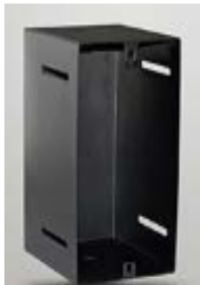
Flush mount back box p/n 9303