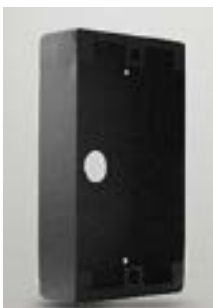
Surface mount back box p/n 9316